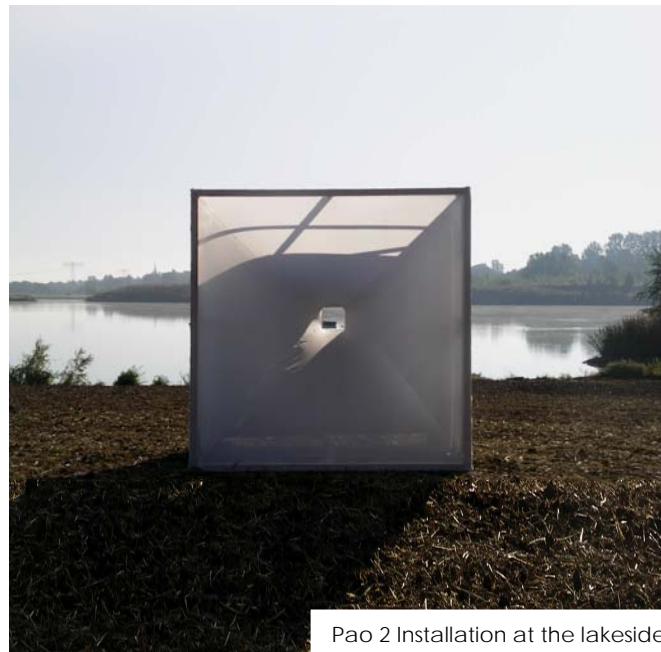
Pao 2 Installation at the lakeside

● Lake-side Art Walk There is a beautiful lake at the edge of Schwabhausen-village. Along the lake-side - and perhaps on the lake itself - we install a number of land-art objects. They shall enhance this beautiful setting, respond to nature and technology alike, and make people aware of place, material, and history.