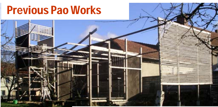
Pao 1 (2005): Teahouse / Panorama Tower