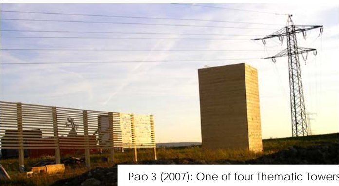
Pao 3 (2007): One of four Thematic Towers