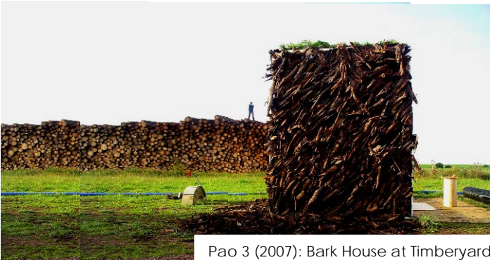
Pao 3 (2007): Bark House at Timberyard