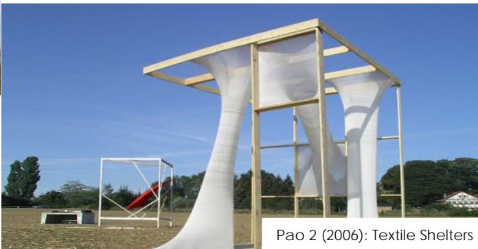
Pao 2 (2006): Textile Shelters